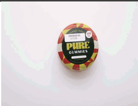
Residual Solvents (GC-MS) Analyzed: By: